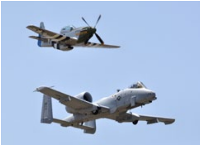
A P-51 Mustang and A-10 Thunderbolt II fly a heritage formation over the Naval Air Station Fort Worth JRB, Texas, Air Expo 2011 April 16. The base played host to more than 100,000 people on the first day of the two-day air show and open house. The U.S. Navy Blue Angels flight demonstration team headlined the event.