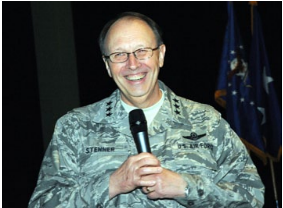
Members of 10th Air Force and 301st Fighter Wing were greeted by Lt. Gen. Charles E. Stenner, commander of Air Force Reserve Command, April 21. General Stenner discussed the current state of the Air Force Reserve, along with areas the command is focusing on.

The general stated that AFR2012 is designed not only to take care of reservists by making the process for deployment easier on them, but their