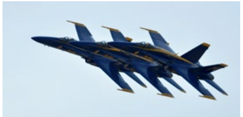
Three of the U.S. Navy's Blue Angels flight-demonstration team fly over the 2011 Air Power Expo in an echelon formation, April 17, at Naval Air Station Fort Worth Joint Reserve Base, Texas.